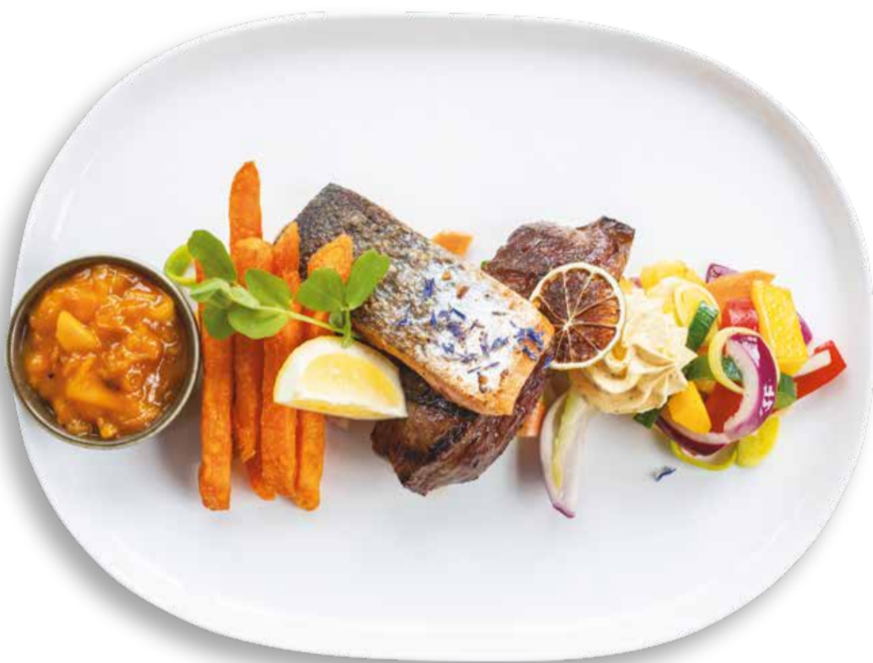
STEAK & FISH

SALMON STEAK 150 g 32,90 with Café de Paris, leaf spinach and parmesan-polenta